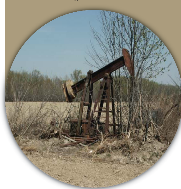
Orphaned Oil Well in Pike County

Our Mission: Encouraging the responsible development of Indiana's oil and gas in a manner that is protective of public health and safety, and the environment